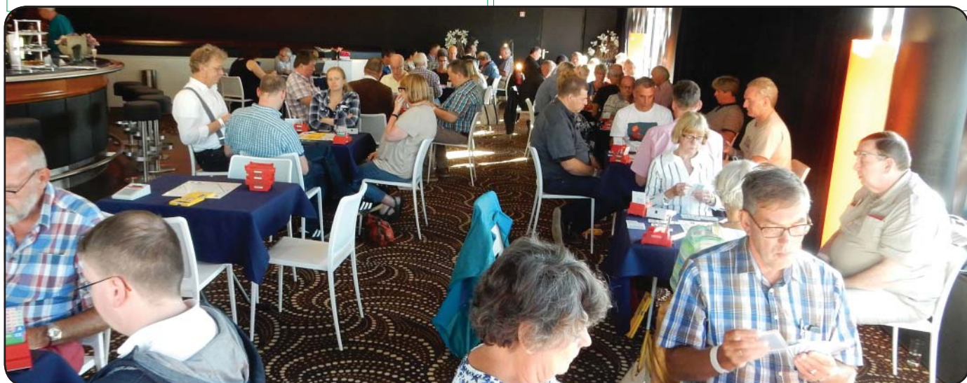
The Players in The Holland Casino for the Butler Pairs